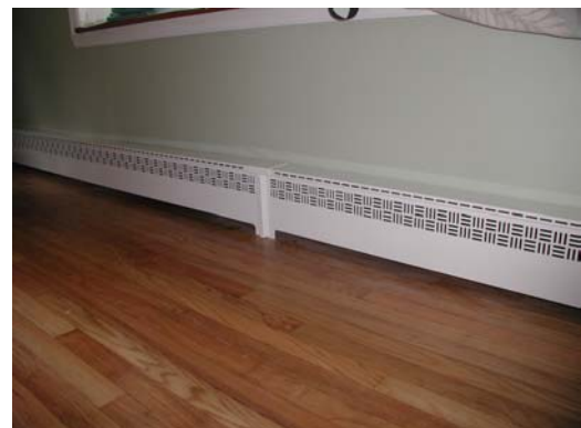
#6 – Slide back flange of new panel down into mounting brackets.