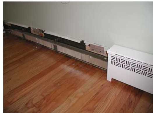
#4 – Install two mounting brackets for each panel.