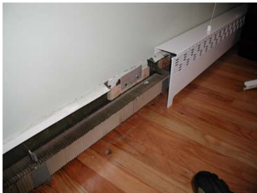
#3 – Cut back top panel with metal snips and install spacer board and mounting bracket flush with the finished wall surface.