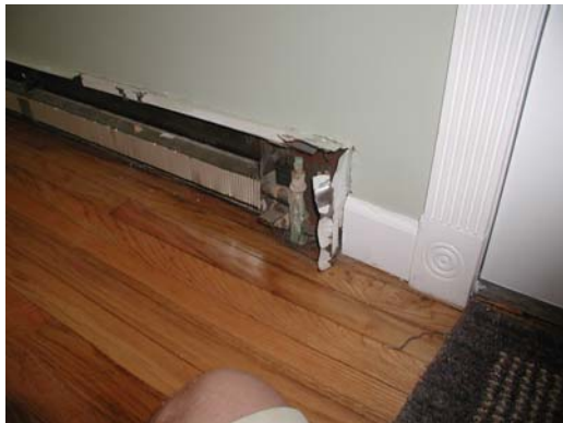
#1 – Existing baseboard enclosure's back panel is recessed into the wall cavity.