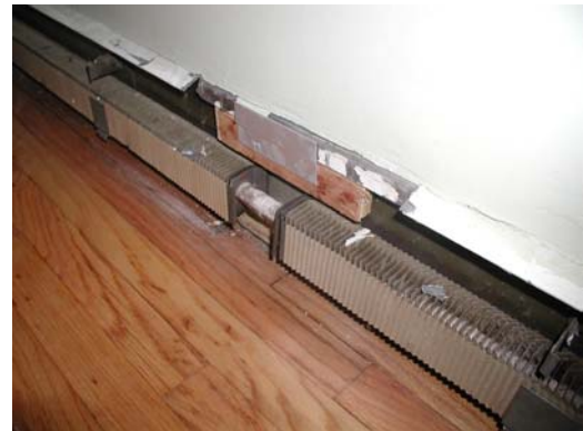
#2 – Position Radiant Wraps panel on wall and mark sections where there are no teeth. Locate and install spacer board and mounting bracket.